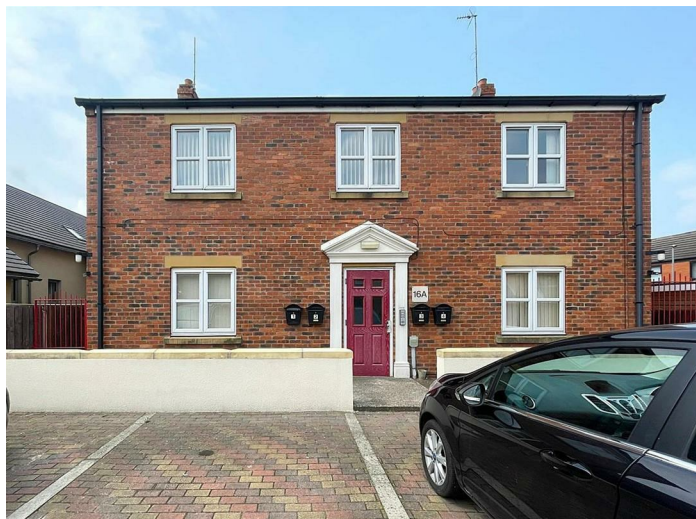
Front - External